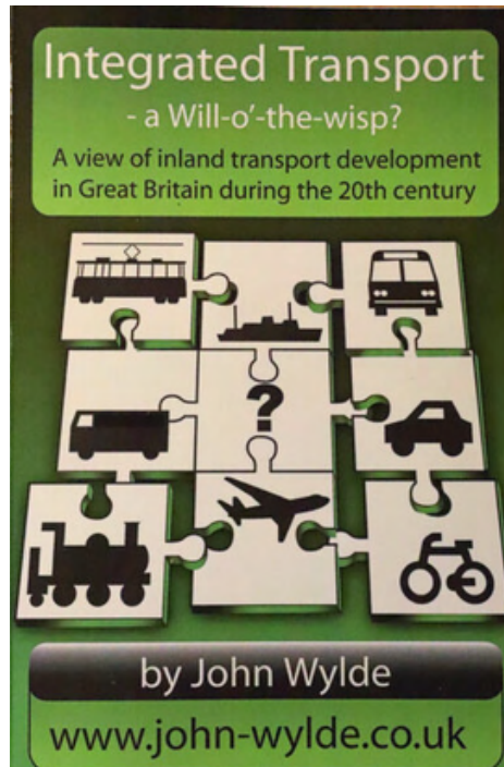
Integrated Transport – a Will-o'-the-wisp? John Wylde

A review of 20 th Century inland transport development