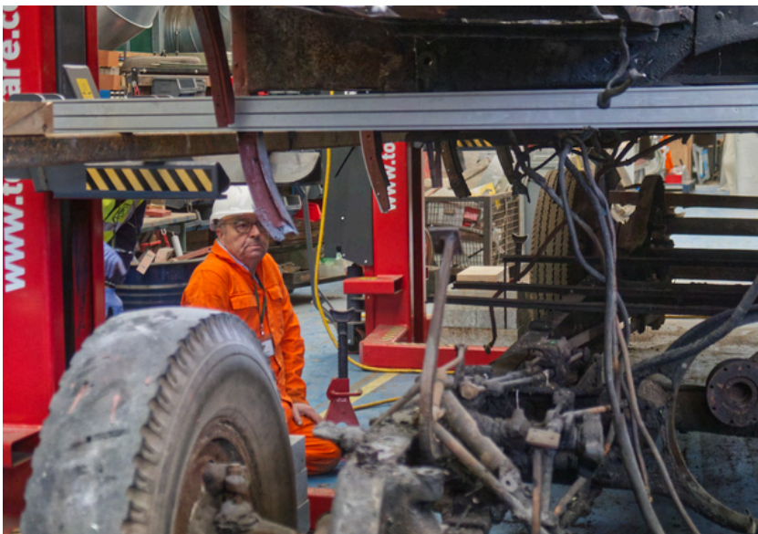
The historic body separation attracted quite an audience from around the Museum that day!