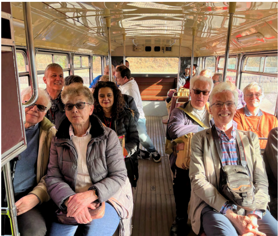
OTHER PHOTOS: EDITOR